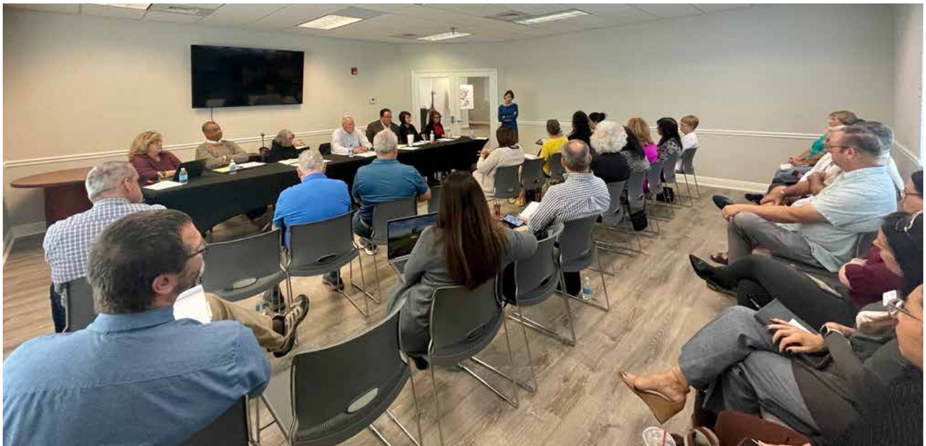
Community Foundation board and staff members came together in southern Sarasota, Charlotte and DeSoto counties with humanitarian, faith, business, and civic leaders to learn where long-term support could be most effective. This meeting in Venice brought together more than 25 entities to offer guidance and feedback.

This is perhaps the most challenging part of helping with our region's recovery—resisting the urge to jump right in—after all, responsiveness is critically important when addressing a crisis. We were fortunate, in the immediate aftermath, to have Season of Sharing dollars