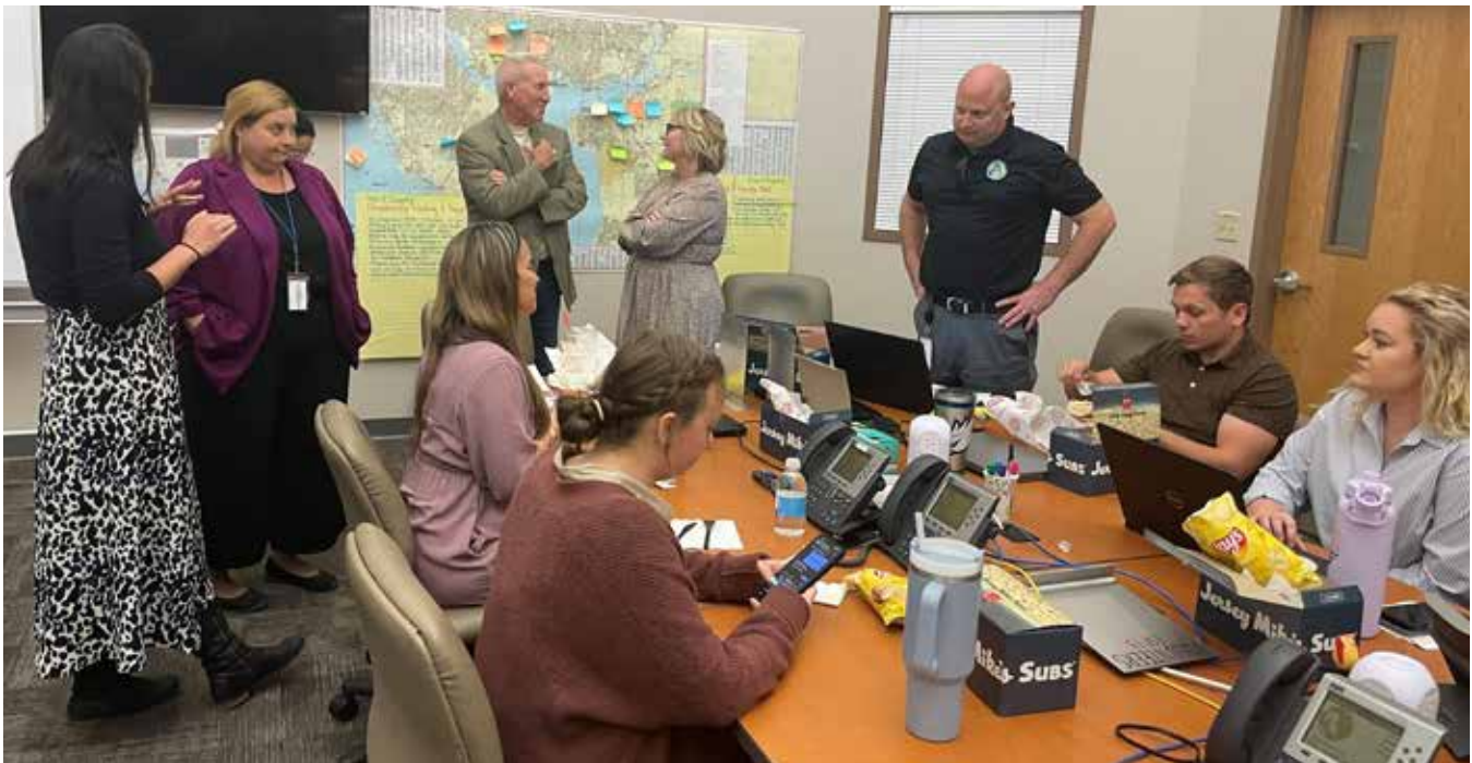
At the Emergency Operations Center in Punta Gorda, Charlotte County’s Long Term Recovery Group shared how their experiences with previous hurricanes has strengthened relationships, and a commitment to informed, holistic recovery.

able to offer support through the Greater Houston Community Foundation, and similar referrals were made to The Miami Foundation following the collapse of the Surfside condominium.