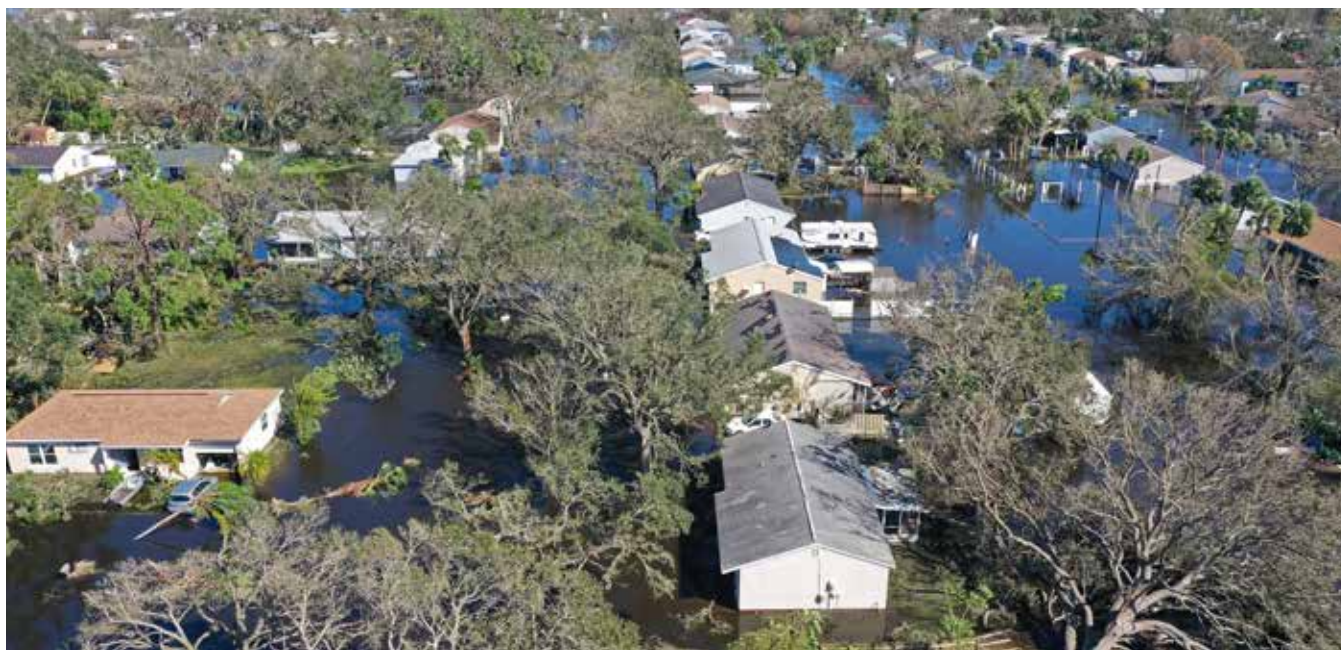
Floodwaters from Hurricane Ian overtook homes in North Port’s Country Club Ridge neighborhood.

Everyone appreciates choices, and this is especially true in philanthropy. Donors want to be assured that their generosity is targeted to the areas of their passion, supporting the causes they care about. Whether donors want to play a part in a large-scale collective strategic effort or know they have directly impacted a family, sparing them from deeper crisis, there are many ways to engage in and uplift this community we all call home. 🏡